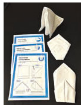
Table Setting Worksheets & Napkin Folding

Elevate your table setting with our Napkin Folding Collection : The Cone, The Sail, and The Diamond.