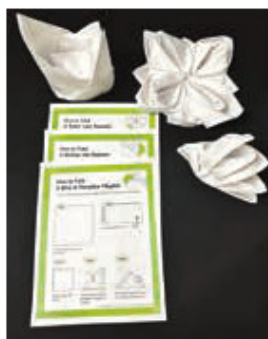
Table Setting Worksheets:

Make a statement with our Advanced Napkin Folding Designs : Bird of Paradise, Water Lily, and Bishop Hat. Pair these exquisite folds with our Informal Table Setting or Formal Table Setting . The kit includes step-by-step guides and four place settings , complete with a water glass, wine glass, dinner plate, salad plate, soup bowl, bread plate, coffee cup, napkin, butter knife, and silverware, all neatly stored in a convenient storage box.